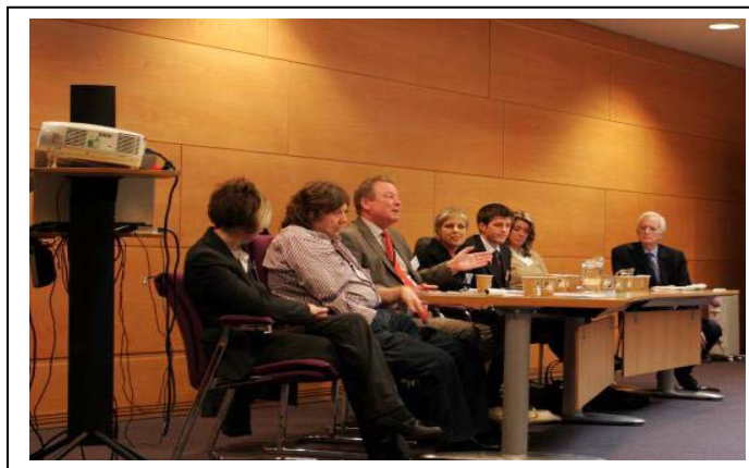
Thanks to London Councils for hosting this event

Personalisation is a lot more than personal budgets